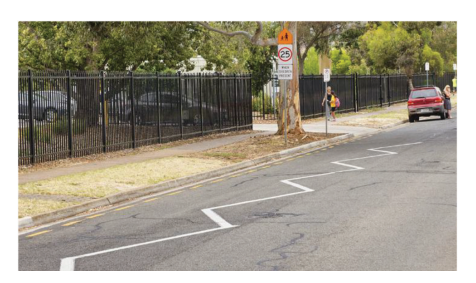
Zig Zag markings

drivers must drive at 25km/h or below after passing the school zone signs and zig zag markings until they reach the end of the school zone. It is best to drive slowly and safely anywhere around schools and always travel 25km/h in school zones in case there are children present that you can not see.